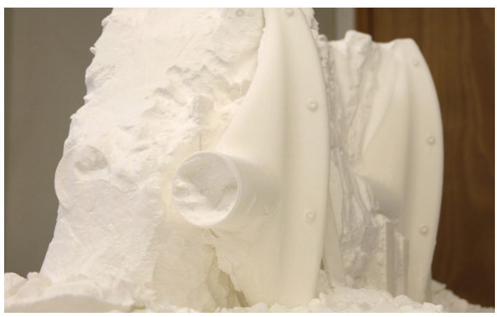
Parts and tensile bars mid-build in Laser Sintering machine