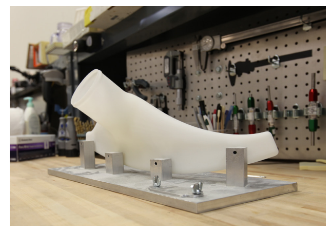
Check fixture for defog duct nozzle

Bell's results exemplify an important certainty for the aerospace industry: embracing additive manufacturing for even the smallest components on an aircraft reaps undeniable rewards.