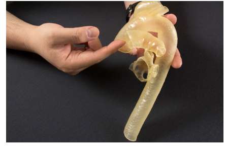
Connex technology helps Renato Archer develop medical prototypes that require flexibility with its range of rubber-like materials.