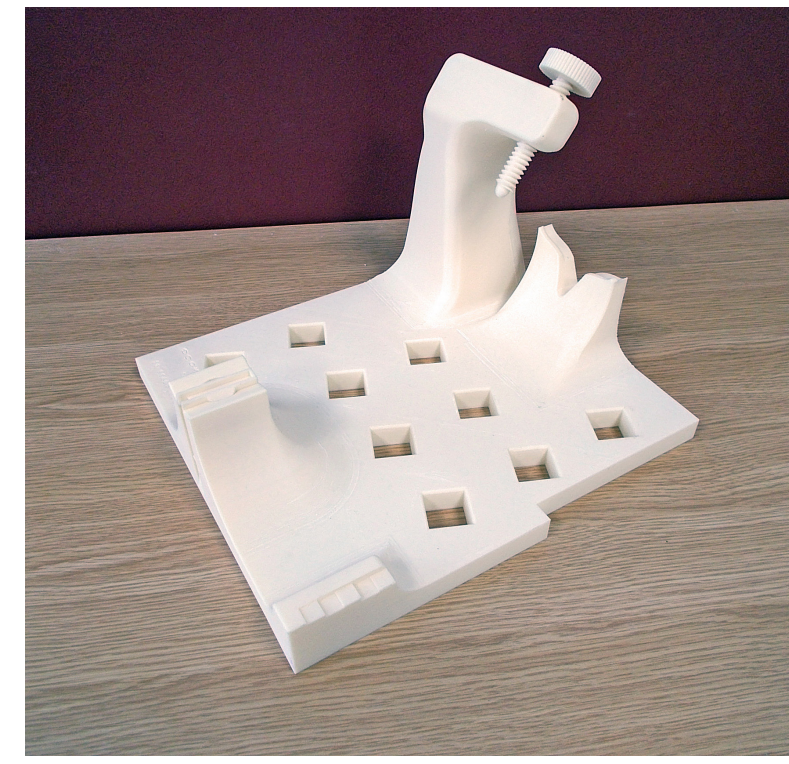
Moog produces a dedicated CMM fixture for every machined component produced on-site at Wolverhampton.

Moog reviewed many options during the evaluation phase and chose the Stratasys Fortus 380mc™ 3D Printer because it met all the required technical standards. "The FDM process of the Fortus 380mc produced a more stable part through the sampling process," said Stuart-Young. "Furthermore, the build envelope and printing materials satisfied our needs, and the price was within our budget."