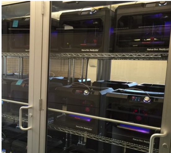
The rack of 3D printers in the Penn State 3D printing lab.

Libraries are well positioned to take responsibility for that kind of instruction. “Since we have such a robust outreach and instructional program, things like 3D printing and a lot of the related issues and opportunities around that are increasingly part of what that outreach looks like,” he says. “We anticipate that that will only continue to be the case.”