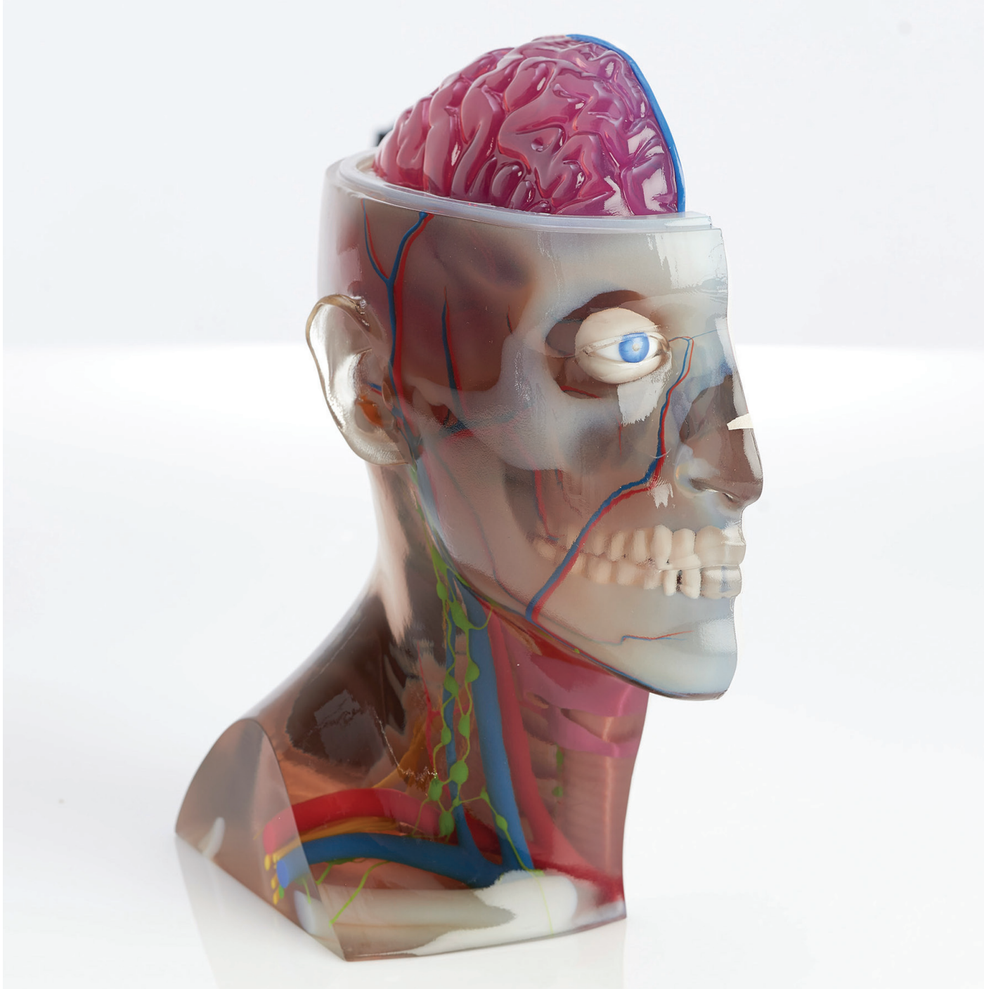
The head and brain model uses transparent materials to reveal internal tissues.