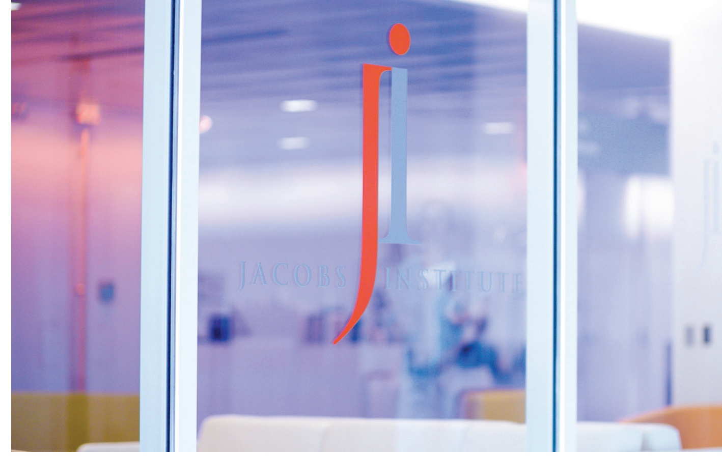
The Jacobs Institute, Kaleida Health's Gates Vascular Institute and University at Buffalo's Clinical and Translational Research Center use 3D printing as a platform for developing cutting-edge medical solutions.