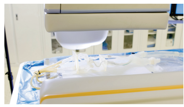
This 3D printed vascular testing model allows medical device designers and engineers to gather valuable performance feedback on device performance.