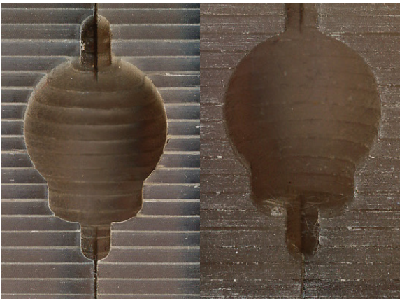
3D printed sectioning block used for rodent brain dissection. The slices created by the segmentation fixture are 2 mm thick and the slots allow a