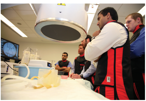
Second-year medical students in training using 3D printed vascular models