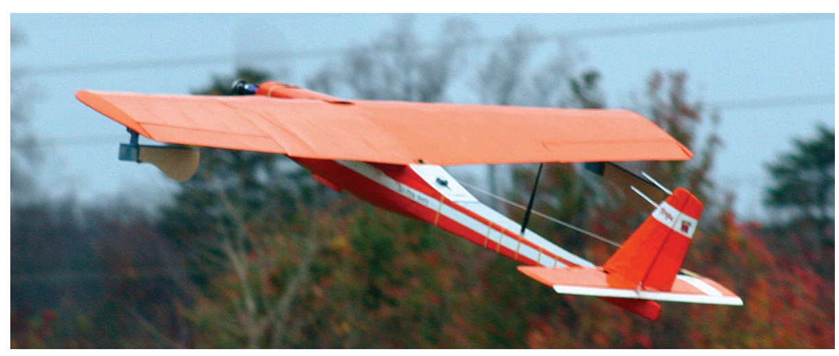
The University of Maryland's funding from the U.S. Army helps analyze alternate modes of flight for potential military applications.

Choosing one type of 3D printer over another is a matter of "give and take," Hopkins points out. One model may be faster in producing the printed piece while an alternate model may promise faster clean-up. SCAD runs both types of printers for different purposes. Printed parts may require a certain level of detail that's better suited for production by one printer than another, he explains.