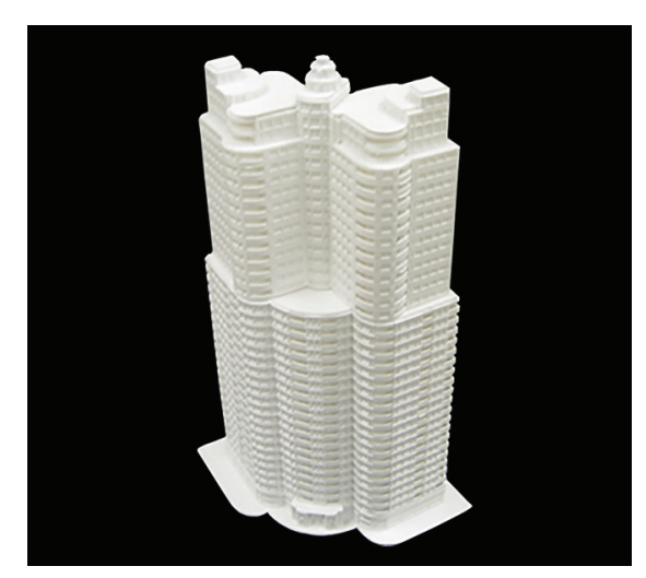
An architectural student at the New England Institute of Technology used the school's Dimension 3D Printer to design a four-foot skyscraper