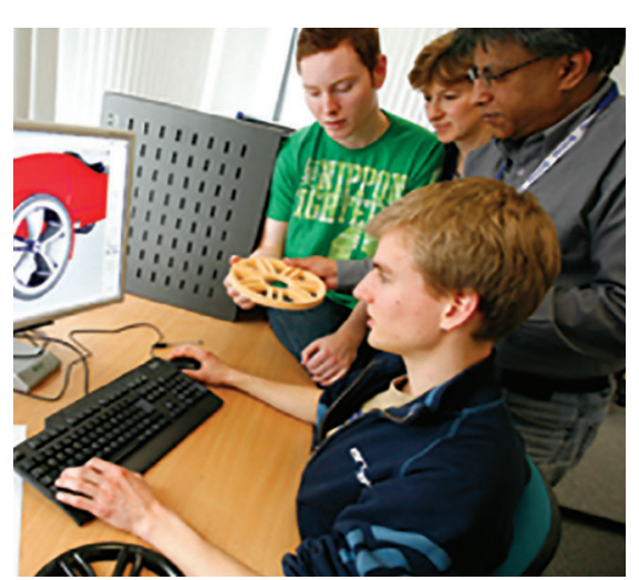
Part of Coventry University's industrial design curriculum includes working with 3D printers, like this Objet 3D Printer.