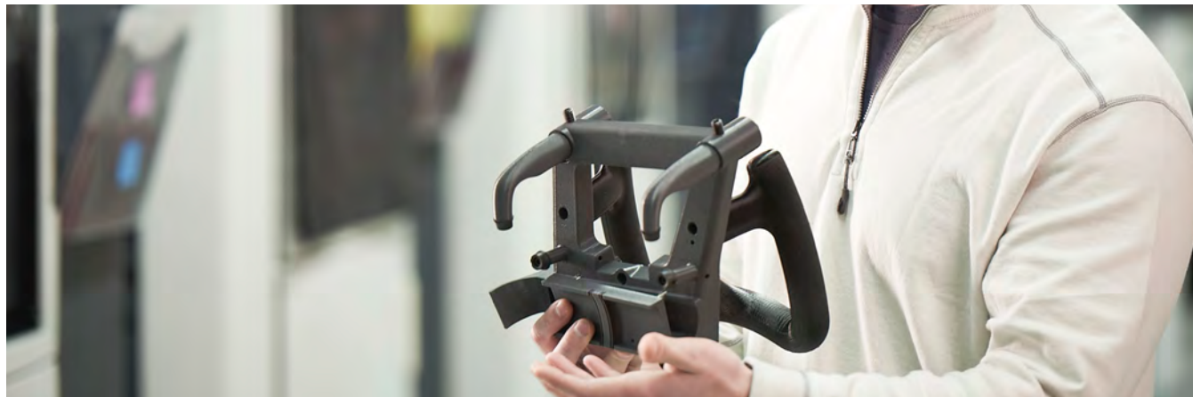
Jigs and fixtures can be used to streamline a variety of production floor operations.