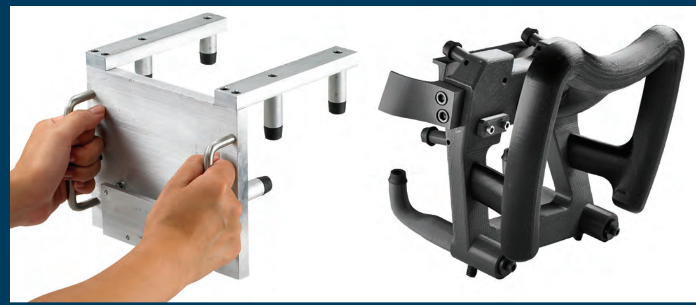
BMW used Fused Deposition Modeling to design lighter fixtures with design complexities.