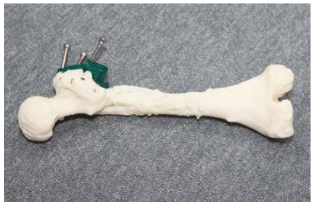
Surgeons's pre-surgery planning using 3D models increases accuracy during the actual surgery. One of the most common incision sites in bone cancer surgeries is at the end of the femur, close to the knee joint.