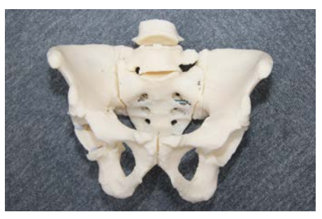
Correcting pelvic fractures requires extreme precision. For complex procedures like determining the angle of screw placement and location of metal implants, 3D models provide the trial time to gain the accuracy desired.