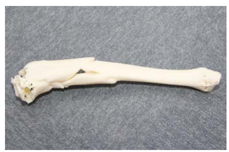
Prince of Wales uses 3D printing in cases ranging from corrective osteotomy (re-alignment of bone from deformity) to complex bone fractures from car accidents, like the above.