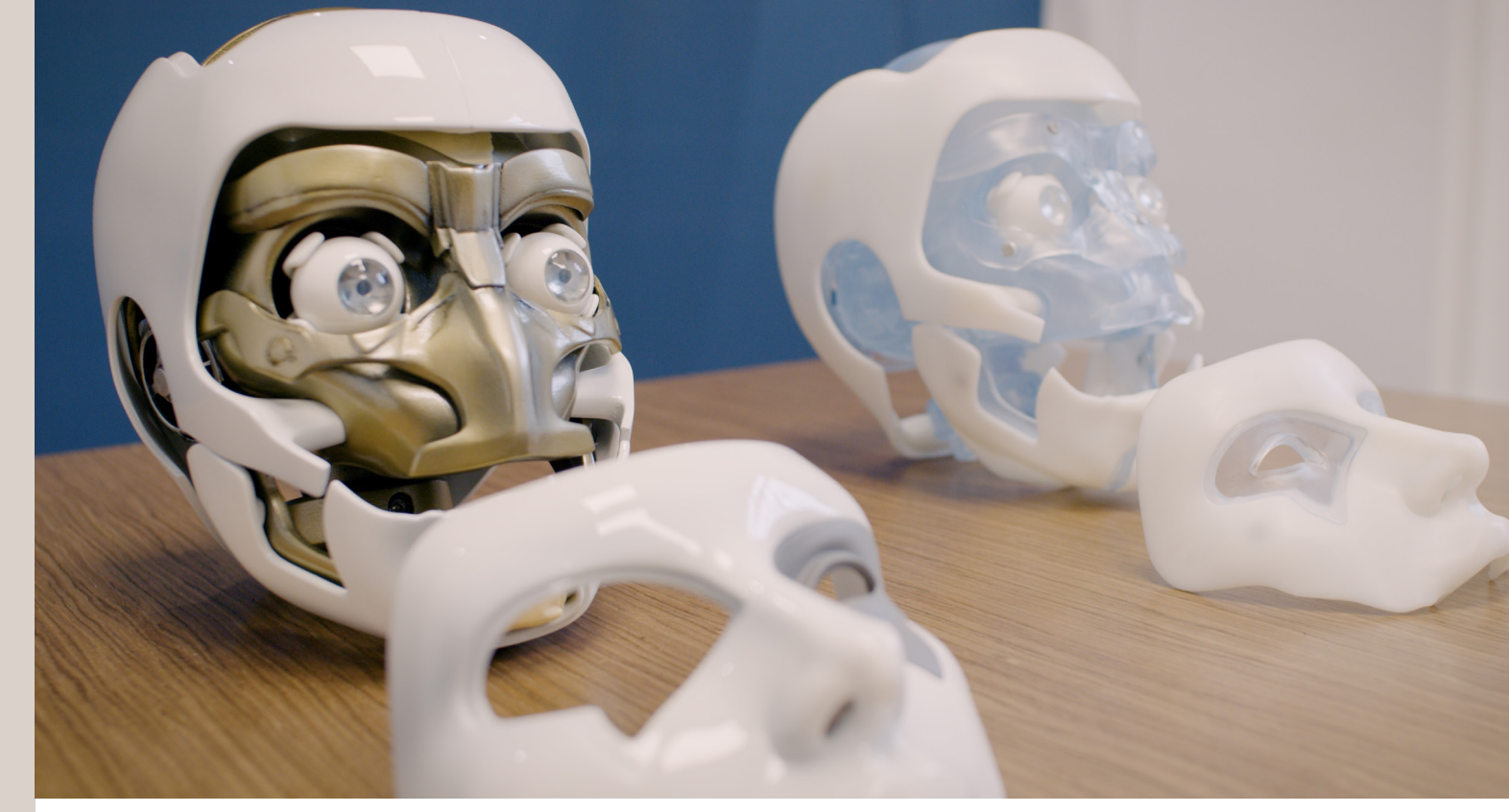
The surface finish of models produced using the Neo800 greatly reduces the post-processing time and replicates actual parts and models with low-volume one-offs used for end-use. (Model in image shown is provided by Jet Cooper of Makinarium.)