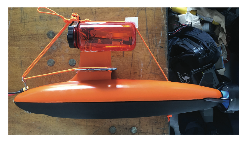
Deployable submarine with camera, encased in 3D printed material

Since their 2014 vessel entry, Team Minion employed a fundamental design shift, choosing to make their vessel an autonomous, reconfigurable sensor platform. "Because we needed the vessel to have communication with the surface at all times, it wasn't possible to deploy a true submarine," said Hockley.