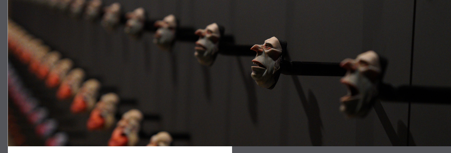
The Wall of (3D printed) Faces at LAIKA's exhibit at the Portland Art Museum entitled, "Animating Life: The Art, Science & Wonder of LAIKA."