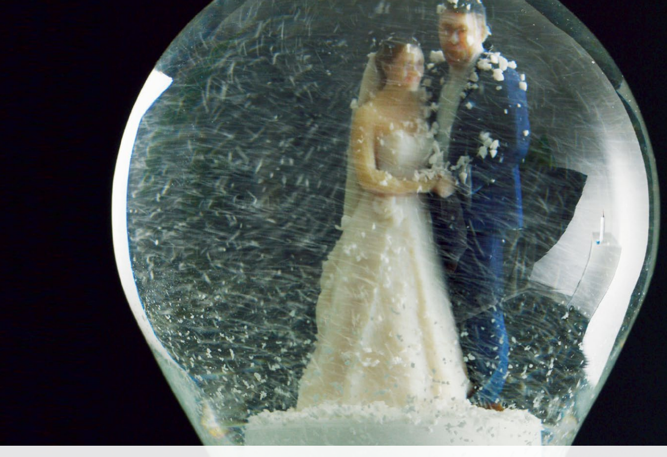
Custom orders for corporate accounts mean Schiner 3D Repro receives orders between 1 to 3,000. The Stratasys® J750<sup>™</sup> allows the company to be flexible and ensure fast turnaround times, regardless of the job size.