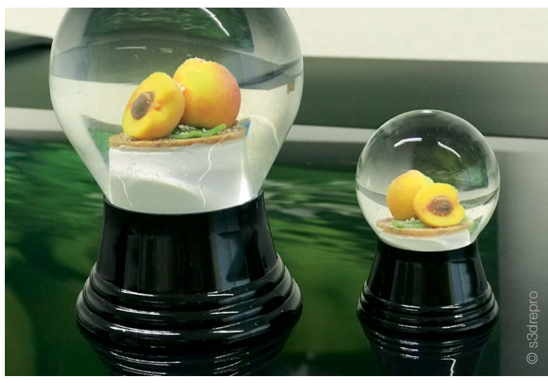
Having access to the J750's full-color spectrum of up to 500,000 colors and six different materials allows texture mapping and color gradients, so figures offer lifelike features, even in small sizes.