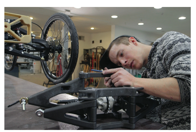
The ability to use Stratasys FDM Nylon 12CF in all stages of the manufacturing process is a game-changer for Utah Trikes.

the machinists can design to fit their needs, then simply print it out," Guy said. "It's taken me a while to wrap my brain around the idea that we can now design for functionality rather than machining."