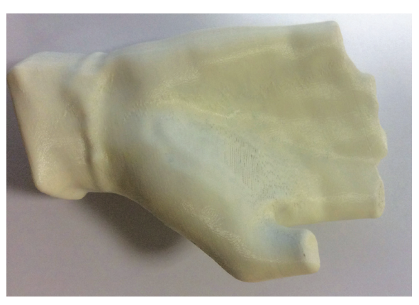
Using its Stratasys FDM 3D printer, the company produces a number of prosthesis that surpass those produced on its industrial robots.