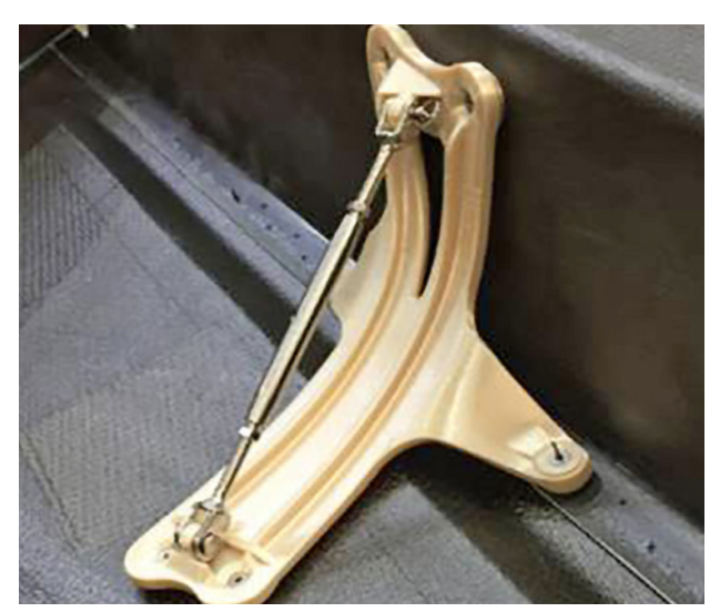
Manufacturing tool 3D printed using ULTEM™ 9085 resin enables Indaero to produce complex shapes that perfectly fit the curvature of aircraft panels not possible with traditional aluminum tools.

Producing high-volume tooling with traditional methods like CNC machining for the aerospace industry is very time consuming and costly. "With our