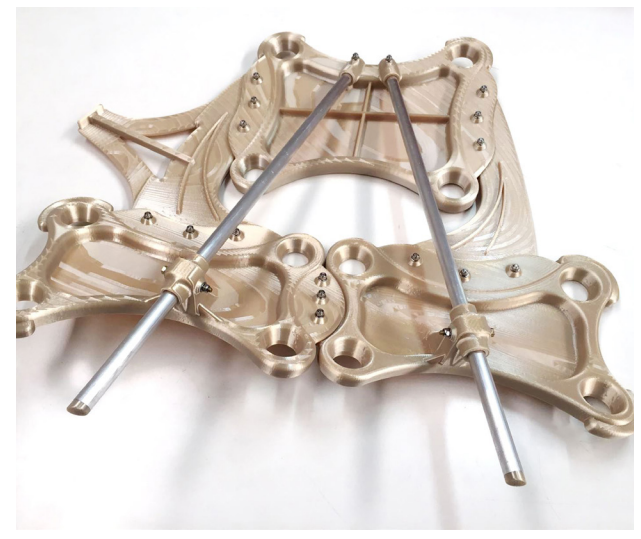
Indaero redesigned and 3D printed a tool nine kilos lighter than the traditionally manufactured tool.

"The 3D printer has been a game-changer for us," said González. "The ability to 3D print curved production tools in robust materials made us realize the importance of having tools that perfectly fit the panels. Not only does it make the work of our operators much easier, it frees up resources and increases our overall productivity."