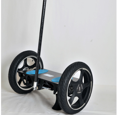
The finished self-balancing scooter designed and manufactured by the University of Applied Sciences Ravensburg-Weingarten.

© 2018 Stratasys Ltd. All rights reserved. Stratasys, Stratasys signet, Fortus 900mc, FDM Nylon 6, Agilus30 and Connex are trademarks or registered trademarks of Stratasys Ltd. and/or its subsidiaries or affiliates and may be registered in certain jurisdictions. All other trademarks belong to their respective owners. Product specifications subject to change without notice. Printed in the USA. CS_DU_ED_UASRW_A4_0118a