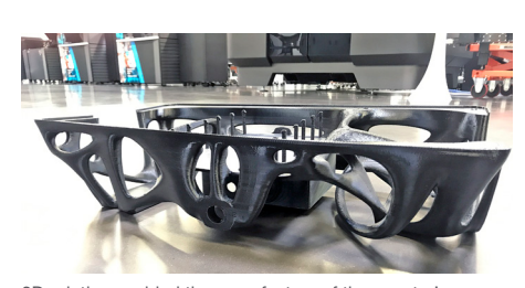
3D printing enabled the manufacture of the scooter's organically shaped frame.

© 2018 Stratasys Ltd. All rights reserved. Stratasys, Stratasys signet, Fortus 900mc, FDM Nylon 6, Agilus30 and Connex are trademarks or registered trademarks of Stratasys Ltd. and/or its subsidiaries or affiliates and may be registered in certain jurisdictions. All other trademarks belong to their respective owners. Product specifications subject to change without notice. Printed in the USA. CS_DU_ED_UASRW_A4_0118a