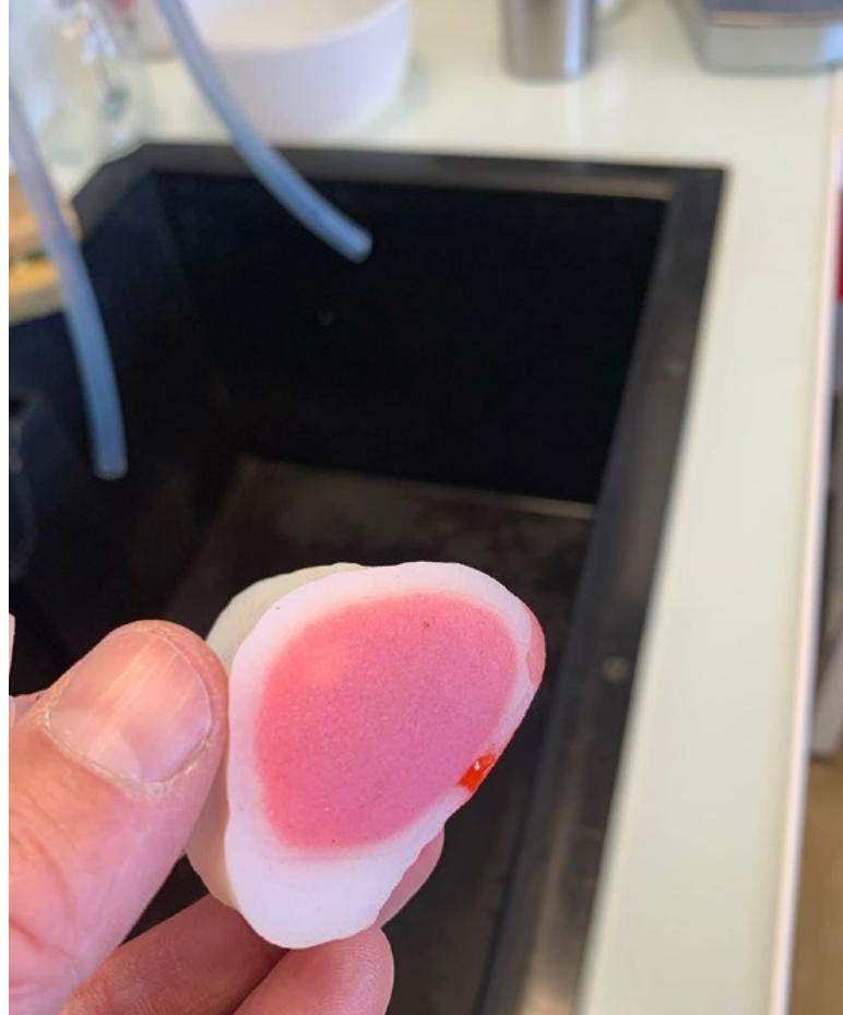
The J5 MediJet’s multi-material multi-color 3D printing capability enables the production of ultra-realistic models for pre-surgery preparation and training

The short-comings in the hospital’s existing alternative technologies also meant that the production of some models had to previously be out-sourced to external providers. Nevertheless, with a level of quality that fell short of the hospital’s requirements, together with a mounting need to better manage increasing volumes, the acquisition of the in-house J5 MediJet made logical business sense.