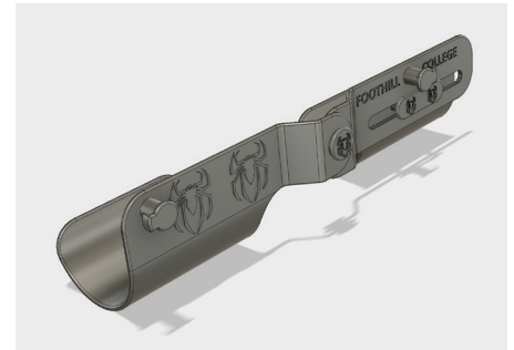
3D CAD drawing of the exoskeleton arm designed by biomedical device engineering students at Foothill College.