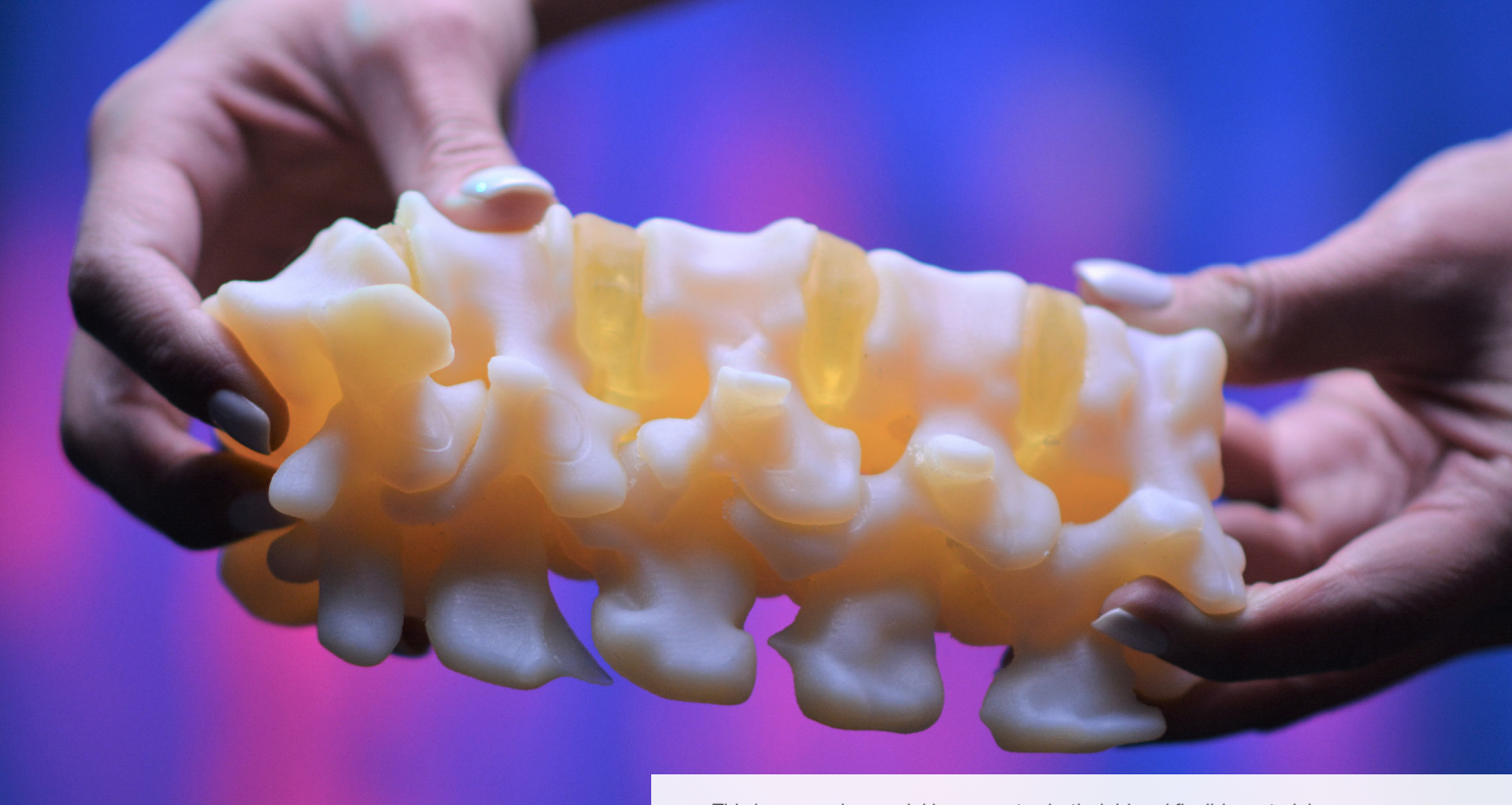
This human spine model incorporates both rigid and flexible materials.

But despite this capability, the JI had reached the limits of current 3D printing materials. To stay true to its mission of innovation, new technology was needed. That meant new materials with a realistic feel and response, more representative of real human tissues. Human cadavers and animal models provide a close approximation, but they can't replicate specific human pathologies. They can also be costly to acquire and maintain.