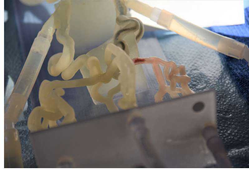
This 3D printed vascular model is being used to train on the removal of a clot.