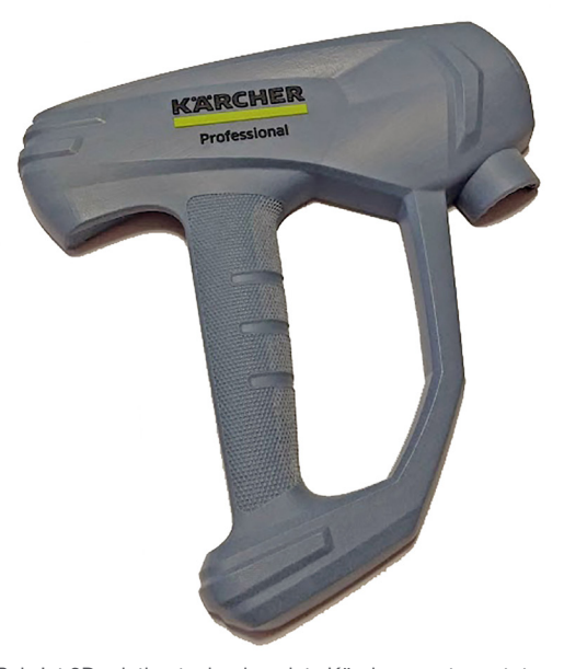
PolyJet 3D printing technology lets Kärcher create prototypes that mimic the final part, speeding prototype development for the EASY!FORCE trigger gun.

"Creating a 3D printed prototype that allows us to replicate the different soft and hard materials in one print shortens our design cycles, as we can make a faster and better assessment that