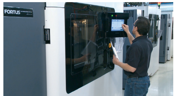
An operator at an FDM-based Fortus® 3D Production System.

The advantages of automation are most notable in the postprocessing phase. For example, a 3D printing technology that spits out dozens of small, highly detailed parts in a few hours may have delivery time measured in days if each part requires more than a few minutes for support removal and finishing.