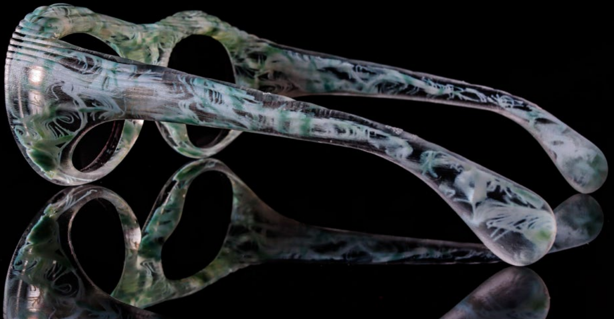
Wind design looks like wisps of smoke trapped in a clear frame