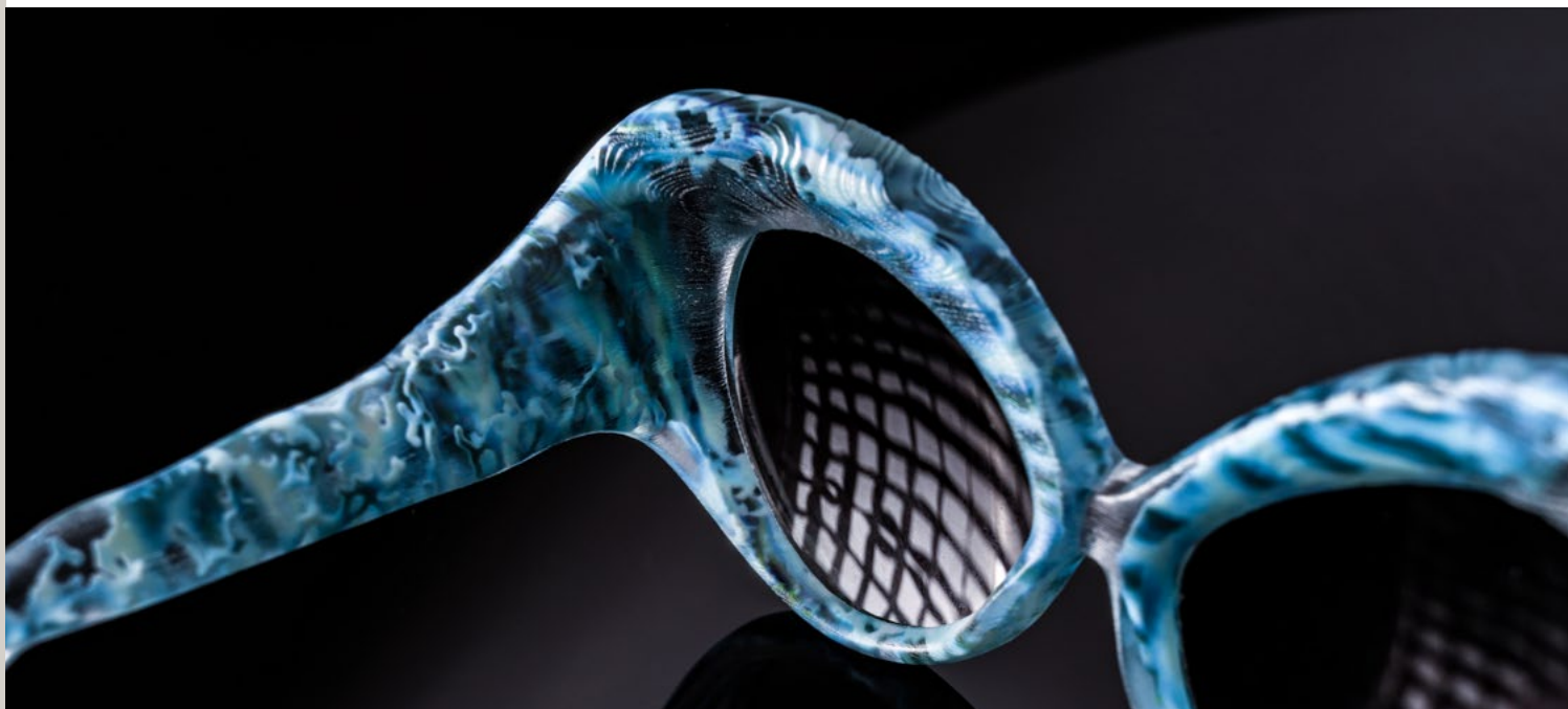
Water design with bubble-like aesthetic

While no method of prototyping is perfect, as Mauriello found the biggest challenge in 3D printing to be exporting files from the software application. After exporting his files, he found the overall process to be quite straightforward. Once exported, Mauriello could easily create his prototypes accurately and on demand with fewer sample errors in a fraction of the time, and at volumes that are impossible through traditional means of manufacturing through injection molding.